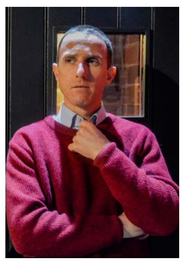
//EAGLES NEST THEATRE PO BOX 232 Brunswick West VIC 3055